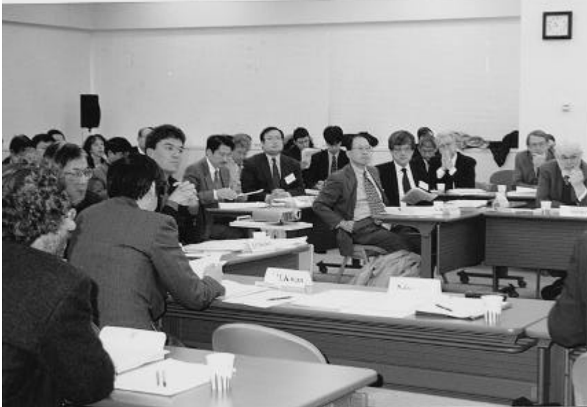
Speakers and participants at the conference – Fujitsu Research Institute, Tōkyō

tung (Friedrich Ebert Foundation) and the German Embassy in Tōkyō for their generous support. It is intended to publish the proceedings at the end of 2001.