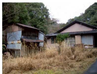
► Nature quickly reclaims areas: an abandoned hamlet in Kozagawa (Wakayama prefecture).