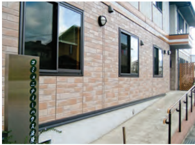
► The name says it all: the “Community House Hōryūji” in Nara Prefecture

The DIJ project “Housing and living arrangements in Japan's ageing society” focuses on communal forms of living for the elderly in Japan. Qualitative interviews are conducted to examine the impact of prior housing and family experiences on their choice of an alternative form of living.