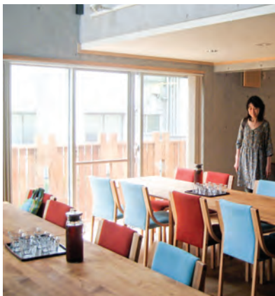
► The communal dining hall for both young and old at the Collective House “Seiseki Sakuragaoka” in Tokyo

More and more elderly people are looking for alternative forms of housing.