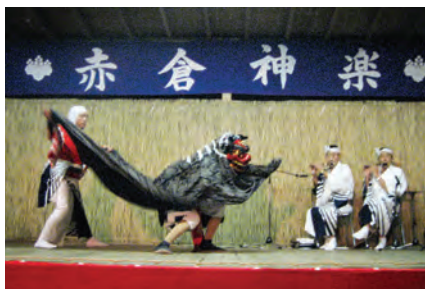
► Kagura performance in Akakura