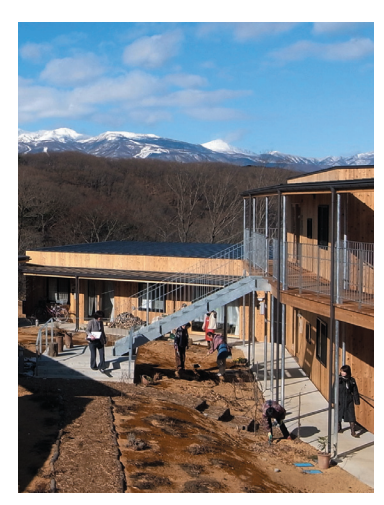
Communal living in Nasu, Tochigi Prefecture.

Could this form of living help improve Japan's economic situation? This was the impression that NHK gave in its programme. Communal forms of living hardly lead to an increase in consumption. Once the housing estate is completed, a number of jobs for people living close-by will materialize because, according to the concept of Community Network, the restaurant – which is open not only to residents but also to the public – will be run by a workers' collective. Meanwhile, some residents speak of a "pleasant reduction" of their lives to the essential: how they take walks in the open countryside, establish contacts with people living in the area and enjoy an ice cream now and then at the nearby dairy farm.