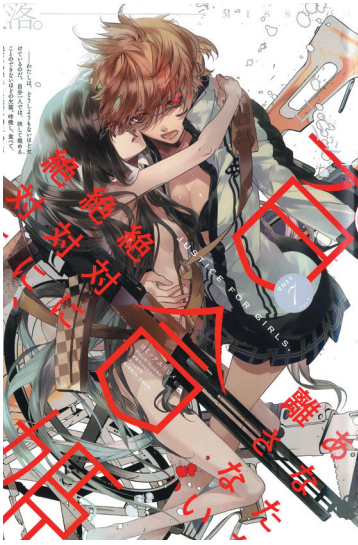
► Cover of a recent issue of the magazine Komikku Yuri Hime .

Manga about love between girls have established themselves as a genre.