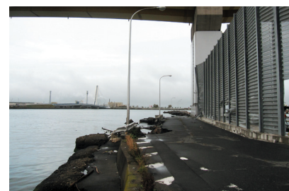
► Traces of destruction in Hachinohe's harbour.

can meet to contemplate the future of their city together, Hacchi can contribute to new perspectives on the city and its inhabitants. When we visited Hacchi in November 2011, people in the “Philosophy Café” ( tetsugaku kafē ), a monthly event that is open to everyone, were discussing the topic of “Happiness after the earthquake catastrophe”.