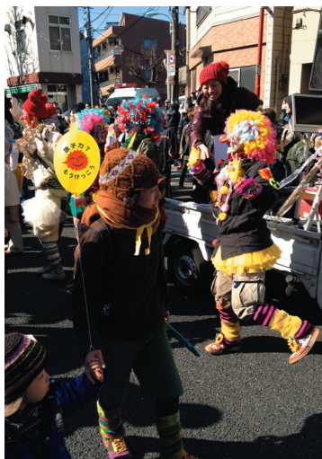
► Parents and children taking part in an anti-nuclear demonstration in Suginami-ku (Tokyo) on February 19, 2012.