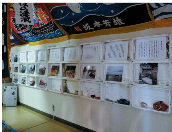
► Styrofoam boxes containing flotsam and historical documents referring to previous disasters in the region.