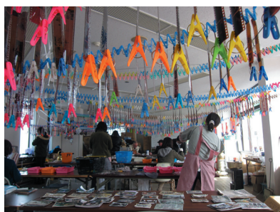
► Volunteers cleaning photo negatives in Sendai's Wakabayashi district, February 2012.