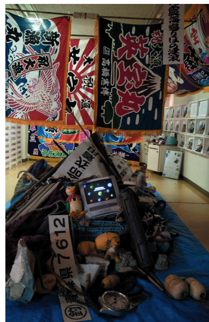
► Flotsam and video installation.

with the aim of opening up a dialogue between locals and non-locals. The notes by citizens living in various areas of Misawa illustrated how perceptions of the catastrophe differed between people living near the coast and those living in higher areas further away from the sea.