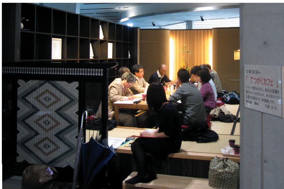
► Talking about “happiness” after the earthquake and tsunami.

The childcare facilities, which are open before and after the opening hours of conventional childcare centres, are as important for Hacchi as exhibitions and other events. Moreover, the concept includes active participant involvement: there are rooms that can be rented for a variety of purposes so that artisans, for example, can sell their products and offer workshops there. Hacchi plays an active role in the city, as for