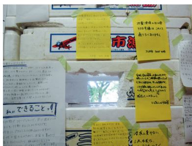
► Personal notes about the disaster by residents of Misawa.

they could experience the tsunami visually and acoustically with the help of video material. The exhibits included personal objects that had been washed away and found in the area, displayed in styrofoam boxes formerly used for fish. Further, the exhibition contained personal notes by residents of Misawa about the earthquake and tsunami. In addition, visitors were encouraged to leave messages for Misawa citizens