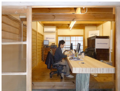
► Work in the Satellite Office.

Green Valley's projects in Kamiyama have reached a certain degree of prominence in the Japanese media. All in all, these projects can be considered as a unique and creative approach to tackling the challenges of demographic change. Yet, whether Green Valley's efforts to revitalize the community and to create a “global Kamiyama” will prove sustainable and thus could serve as a model project providing similar impulses for other regions, remains to be seen.