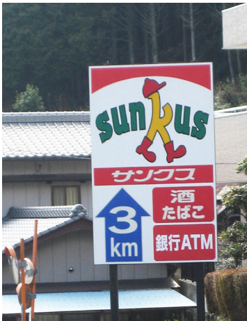
► Street sign pointing to the only convenience store in Kamiyama.

In March 2013, four DIJ grant students exchanged their DIJ workspaces in central Tokyo for the town of Kamiyama in Tokushima Prefecture. For two weeks, they had the opportunity to catch a glimpse of how demographic change, namely an ageing and declining population, affects small communities in rural Japan. In Kamiyama, however, since 2004, the local non-profit organization Green Valley has aimed to tackle these issues and has sought to revive the town.