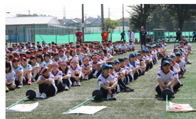
► Impressions from school life.