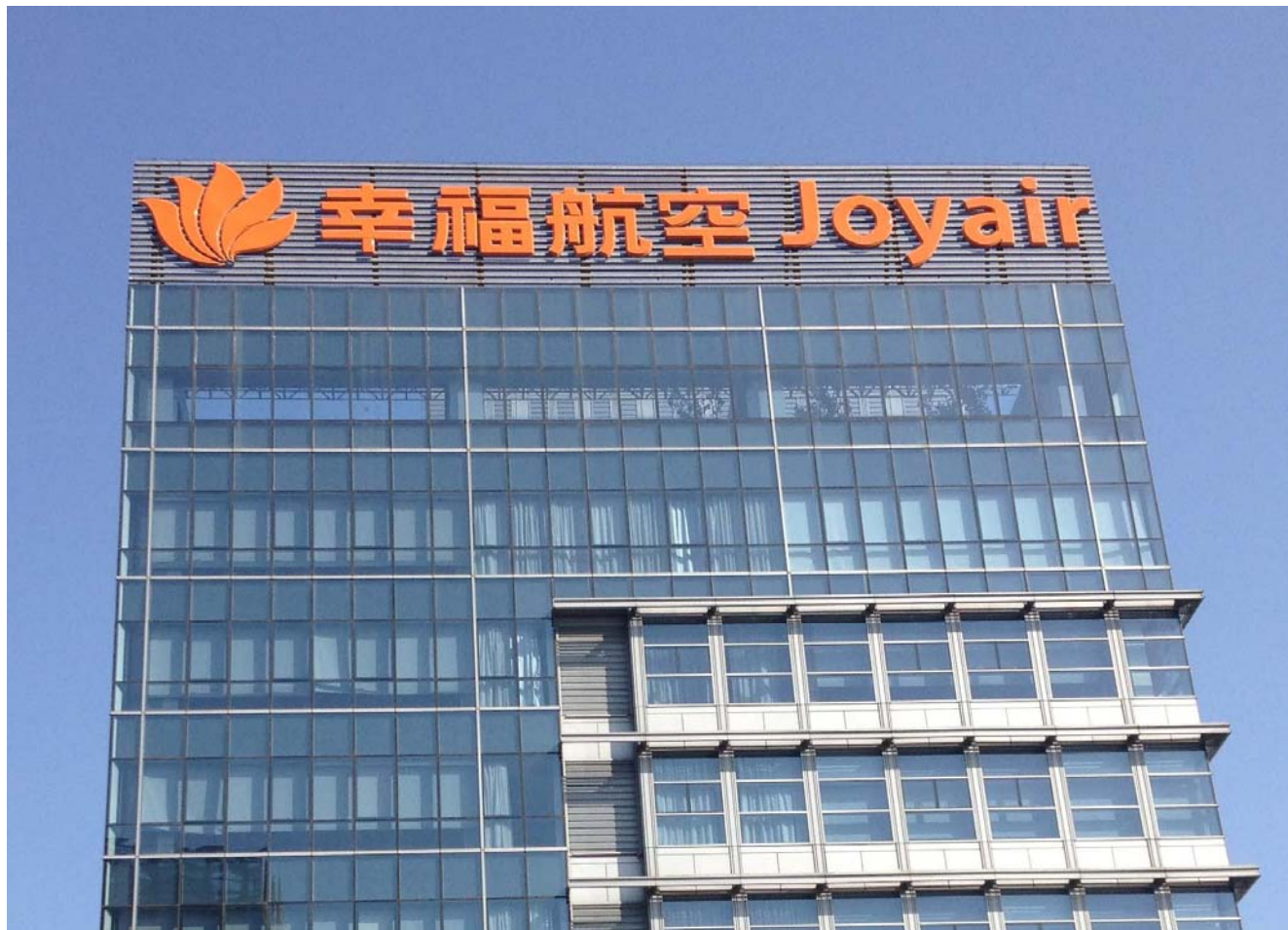
Beijing Sanyuanqiao, October 2013