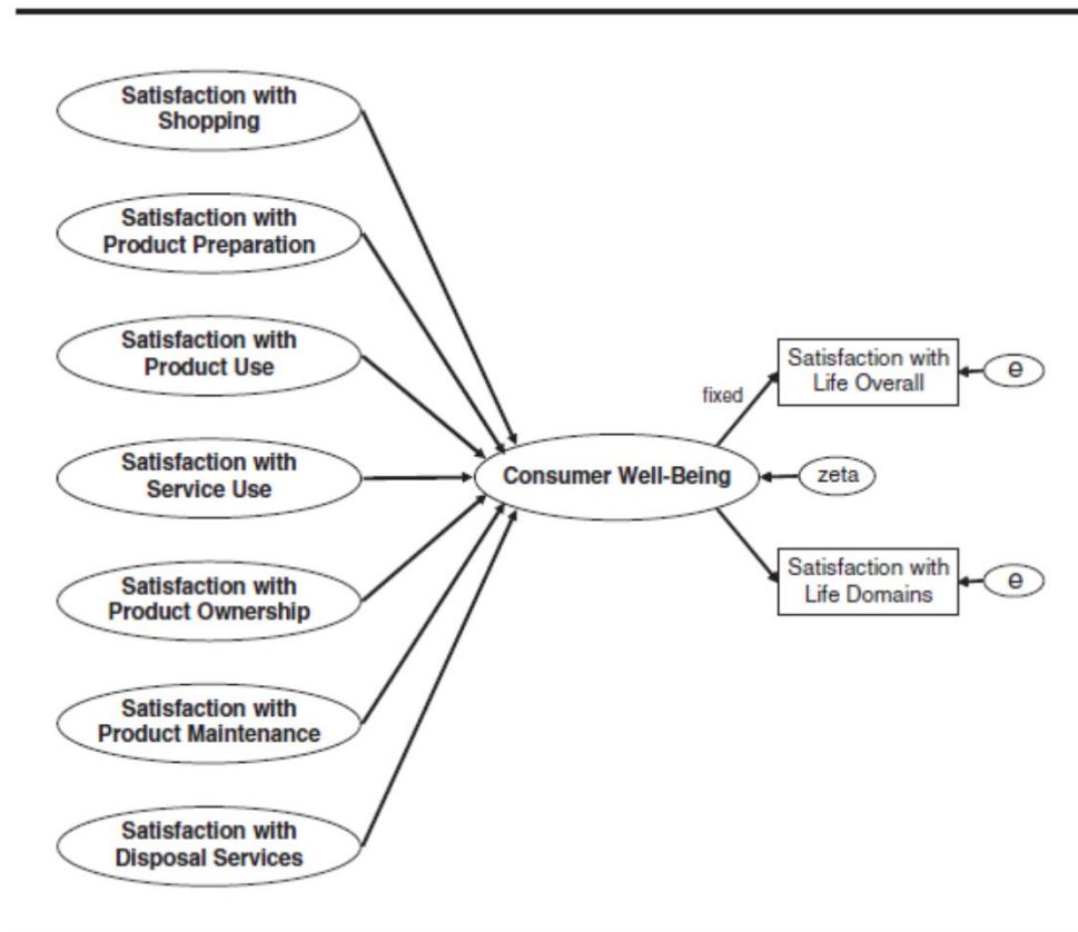
The Research Model