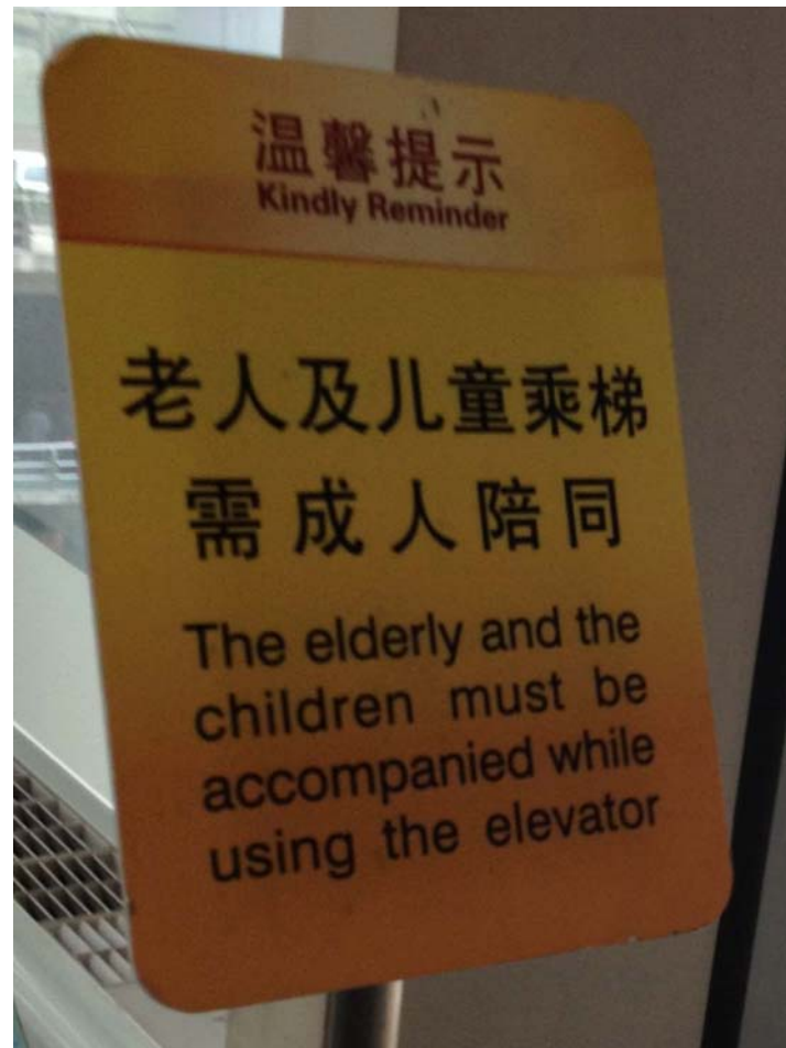
Beijing Capital Airport, October 2013