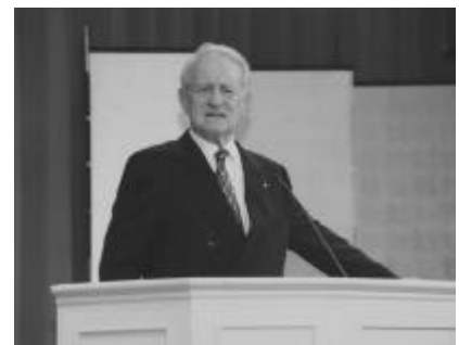
Johannes Rau at the German Cultural Center