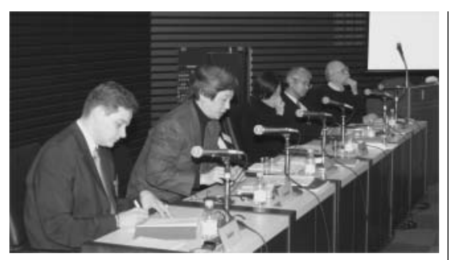
The speakers of panel five at the conference "Pan-Asianism in Modern Japanese History"