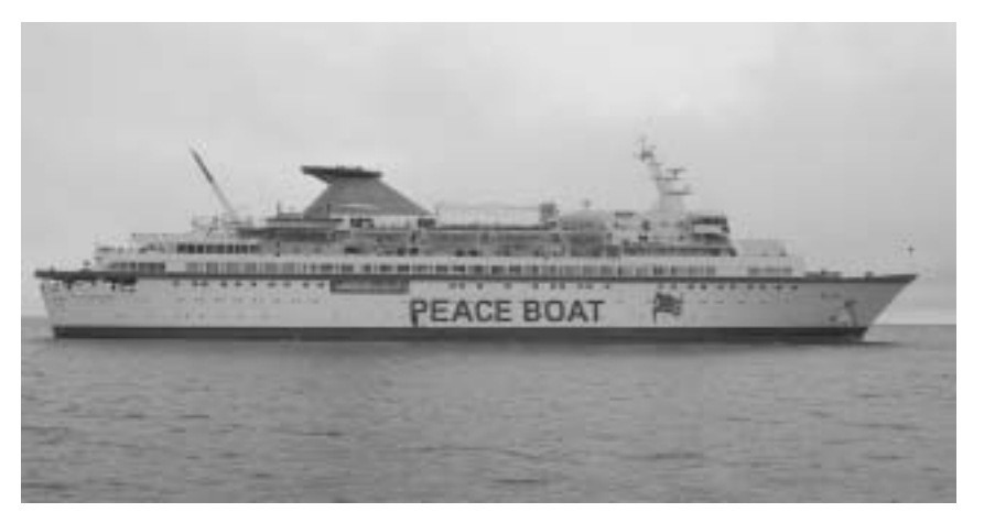
On the way to the Kuril islands