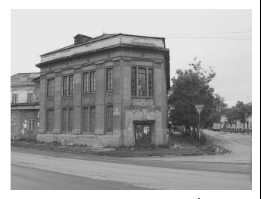
Old branch office of the Hokkaidō Takushoku Bank in Korsakov (former Ōdomari)