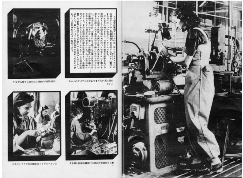
Picture 1, left: Photograph of the Frankfurt Fashion Institute (founded in 1933), one of four such Institutes that served the propaganda concept of “German fashion”. Picture 2, right: The elegant and functional overalls were reproduced in the Japanese magazine Fujin Gahō (1940, 11) and interpreted as a part of the “Movement for the Beautification of Factories”. This German ideal of fashionable and highly productive women workers in the armaments industry was propagated in Japanese magazines to be the model for the organisation of factory work in Japan.

inactivity of German women, repeatedly postulated in many research works, by drawing attention to a non-critical reception in these works of official employment statistics that apparently did not include the many kinds of unpaid jobs in family businesses, for example, and Germer differentiated the all-encompassing significance of motherhood at that time, postulated in the research work on Japan.