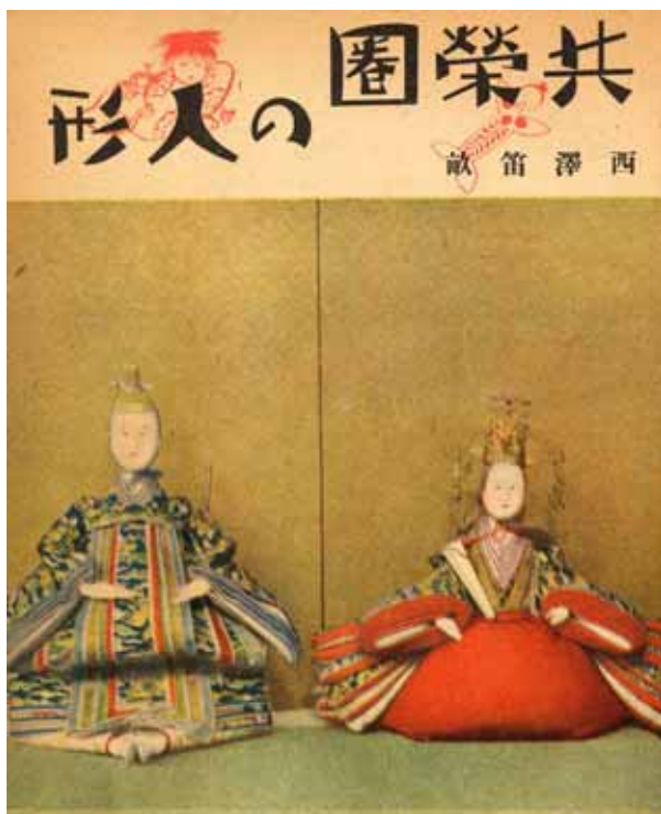
Pictures of “Dolls from the Co-prosperity Sphere” depict Japanese ohinasama dolls in a prominent size and position (picture 4, above) and dolls from other East-Asian countries on the following pages (picture 5, below). While claiming the superiority of Japanese cultural products in text and composition, the cultural connection and heritage of toys of the “Greater East Asia Co-Proprosperity Sphere” is emphasized. The pictorials suggest an image of cultural diversity and harmony effectively hiding the ongoing violent subjugation and exploitation of the colonies.