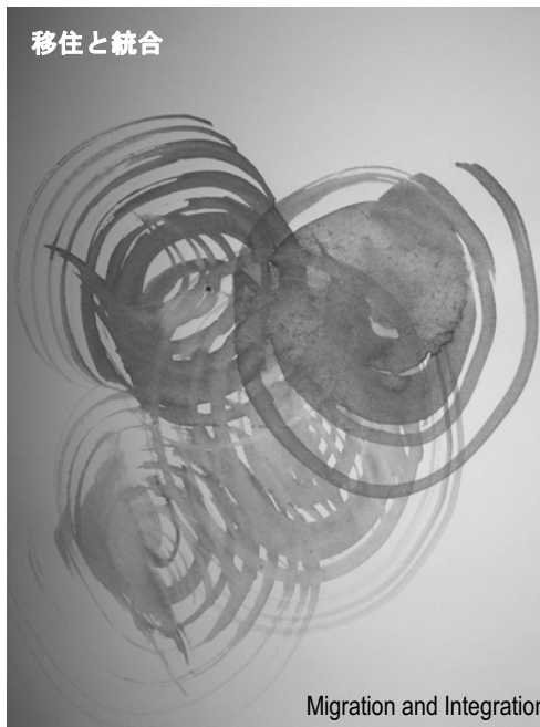
Migration and Integration

How are local and national political actors dealing with those challenges? In what way are non-governmental organizations participating in the process of forming a new migration policy and shaping of migrants' working and living conditions?