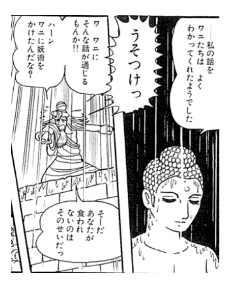
Fig. 5. The composed Buddha and his choleric rival.

Especially in the comics created by Kōfuku no Kagaku the possibilities of visual representation are used to illustrate the teachings of the religious community. Quite often the same faces transmigrate through ages and places, e.g., from Buddha's lifetime in India to the early modern age in Europe and into contemporary Japan. This enables the author to illustrate the idea of rein-