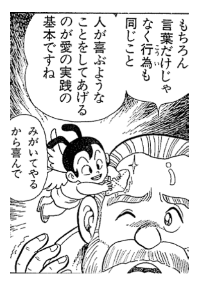
Fig. 2. In "The Gate to Heaven" angelic creatures wash the narrator's forehead and are buried under the weight of love.