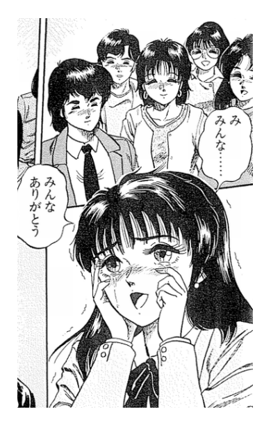
Fig. 8. After her journey to the other world, a new life begins for the young Ai-chan.

carnation and concurrently emphasize the claim to timelessness and universality. The diverse utilizations of the manga medium by this particular community indicate a tendency to illustrate abstract teachings with stories. For example, in "The Gate to Heaven" (Tengoku no mon) the four basic principles of "love," "knowledge," "reflection," and "further development" are explained in four stories. The chapter on love depicts how the hardened heart of a young, unfeeling woman is changed through an accident that brings her close to her death and thus to the spiritual beings of other cosmic dimensions. She learns that "to love" means not to receive love but to "give love" and she is given the chance to live a new life which she leads as a new person (fig. 8). The protagonist's attractiveness and her horror as she becomes aware of her apparent death, her gradual change of attitude under the guidance of a heavenly teacher called Mercy (quite possibly the god Mercury), and her happiness about returning to earth, draw the reader into the story and amplify the lasting imprint of the message.