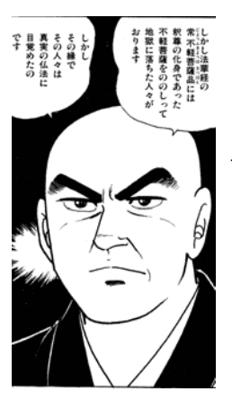
Fig. 7. Nichiren's features marked by decisiveness in a manga drawn by Nobori Ryūta. © Kino Kazuvo-Shiratori Haruhiko, No-Ryūta, bori Sunmark