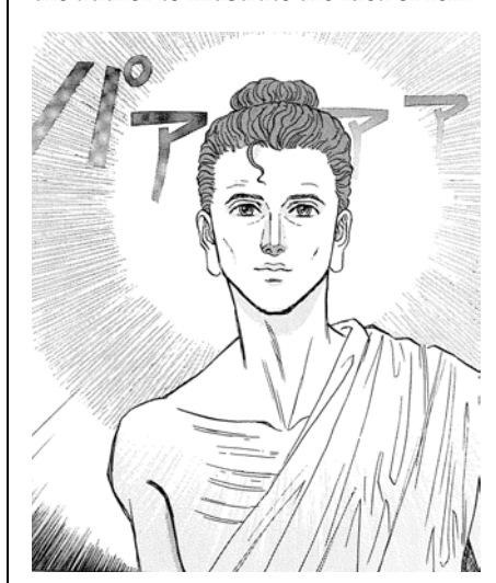
Fig. 6. The haggard Buddha by Ōkawa Ryūhō.

Especially in the comics created by Kōfuku no Kagaku the possibilities of visual representation are used to illustrate the teachings of the religious community. Quite often the same faces transmigrate through ages and places, e.g., from Buddha's lifetime in India to the early modern age in Europe and into contemporary Japan. This enables the author to illustrate the idea of rein-