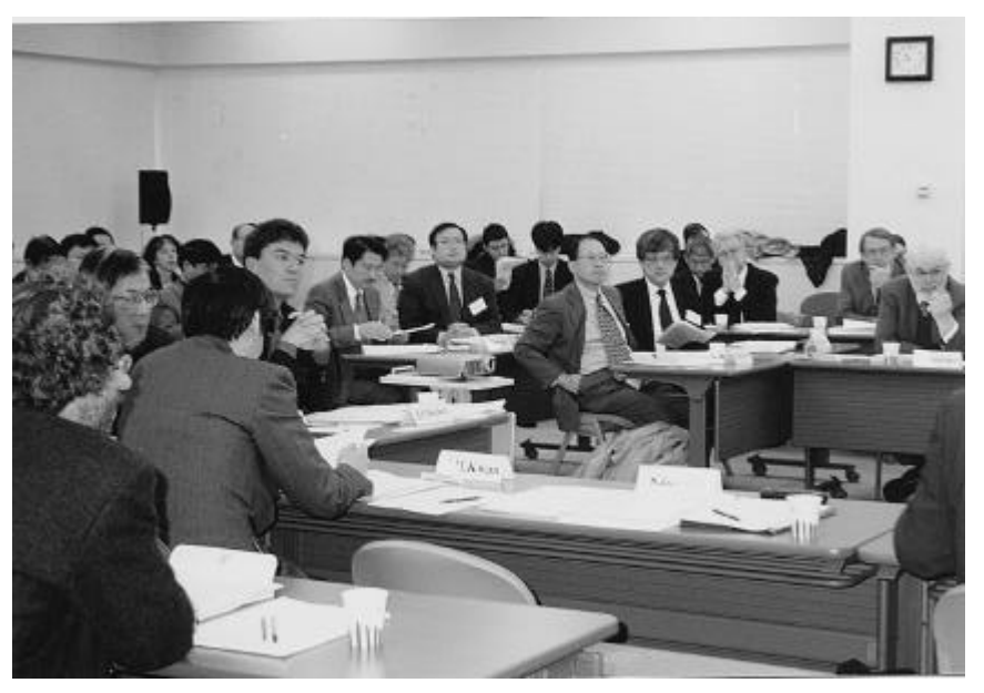
Speakers and participants at the conference – Fujitsu Research Institute, Tōkyō

tung (Friedrich Ebert Foundation) and the German Embassy in T\bar{o}ky\bar{o} for their generous support. It is intended to publish the proceedings at the end of 2001.