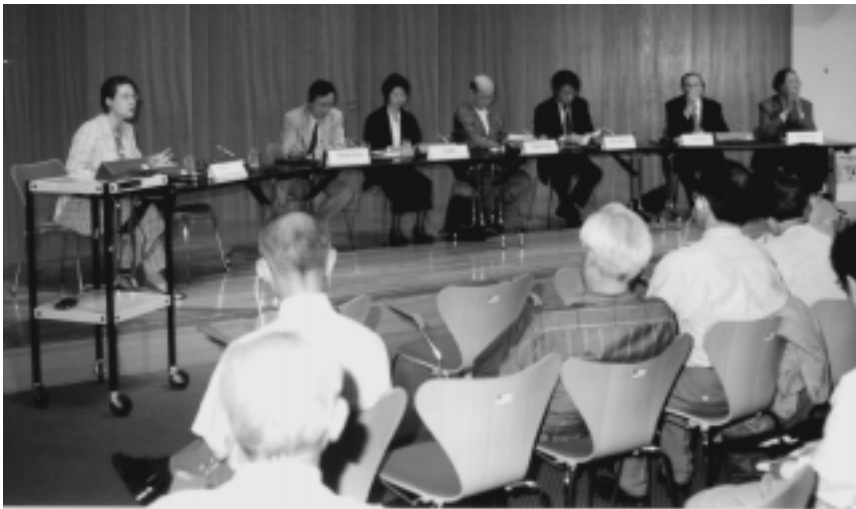
The Podium of the DIJ Symposium „The Plurality of Languages and the Globalization of Science“

rope see in Southeast Asia an important market to promote their brands in the face of international competition as well as a springboard into what may be the market of the future, China.