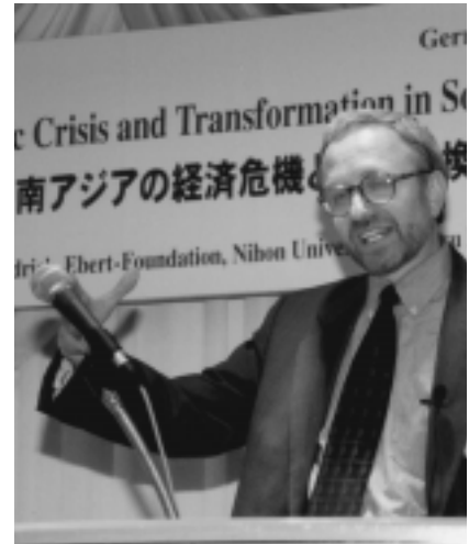
C. Molteni: European firms are optimistic about their future in Asia.

Most of these companies, however, have used the crisis to take stock of operations, showing a new willingness to discuss and question previous regional strategies. For academics in the field, this does not only make an examination of company strategies particu-